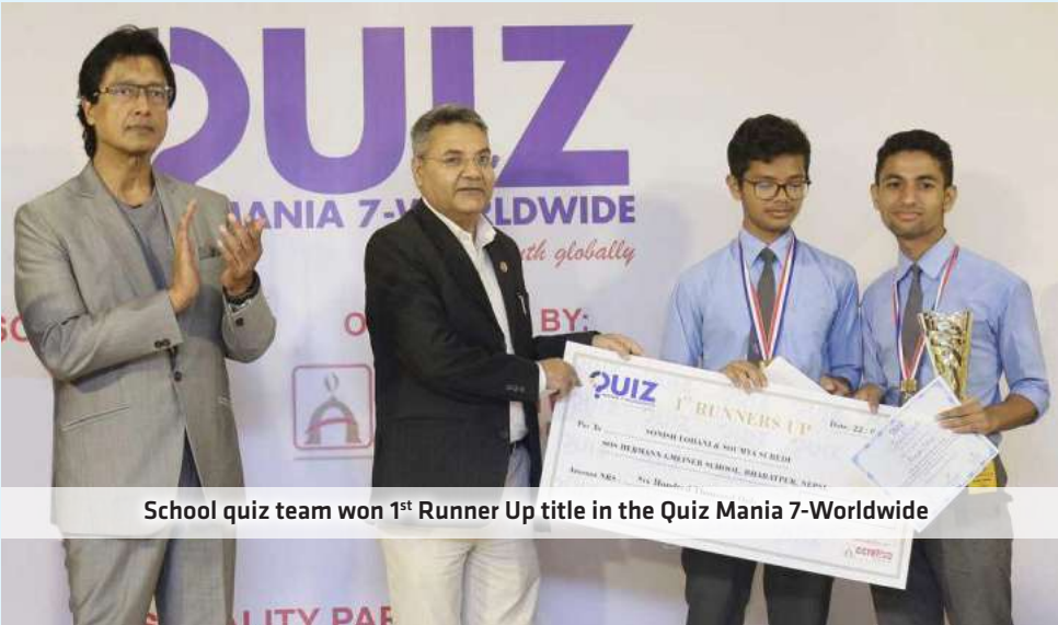
School quiz team won 1 st Runner Up title in the Quiz Mania 7-Worldwide